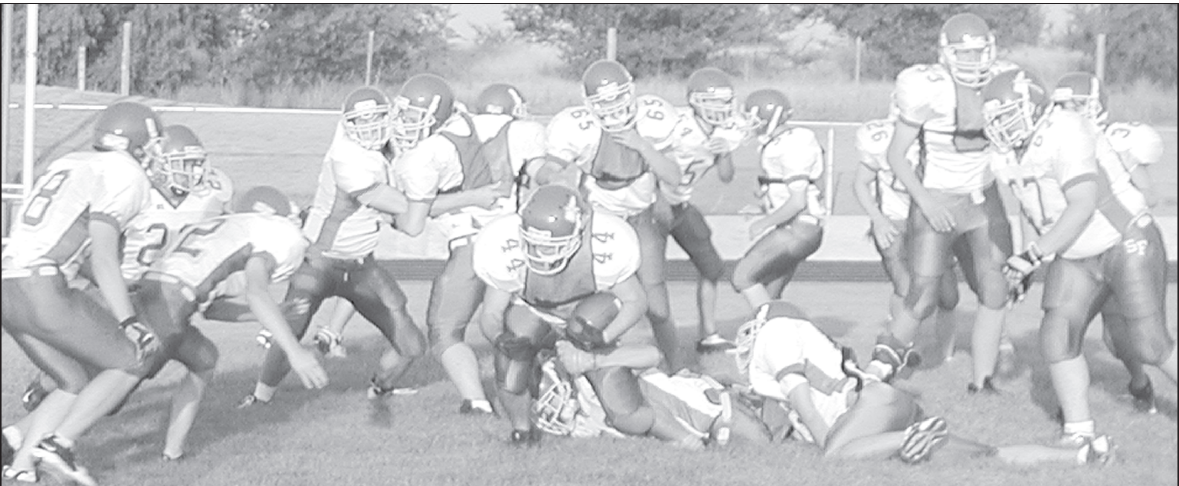
FANS ATTENDING the sports open house on Friday evening were introduced to the Indian football players prior to watching a scrimmage. The season opens in Oberlin on Friday night when St. Francis meets the Decatur Community Red Devils.