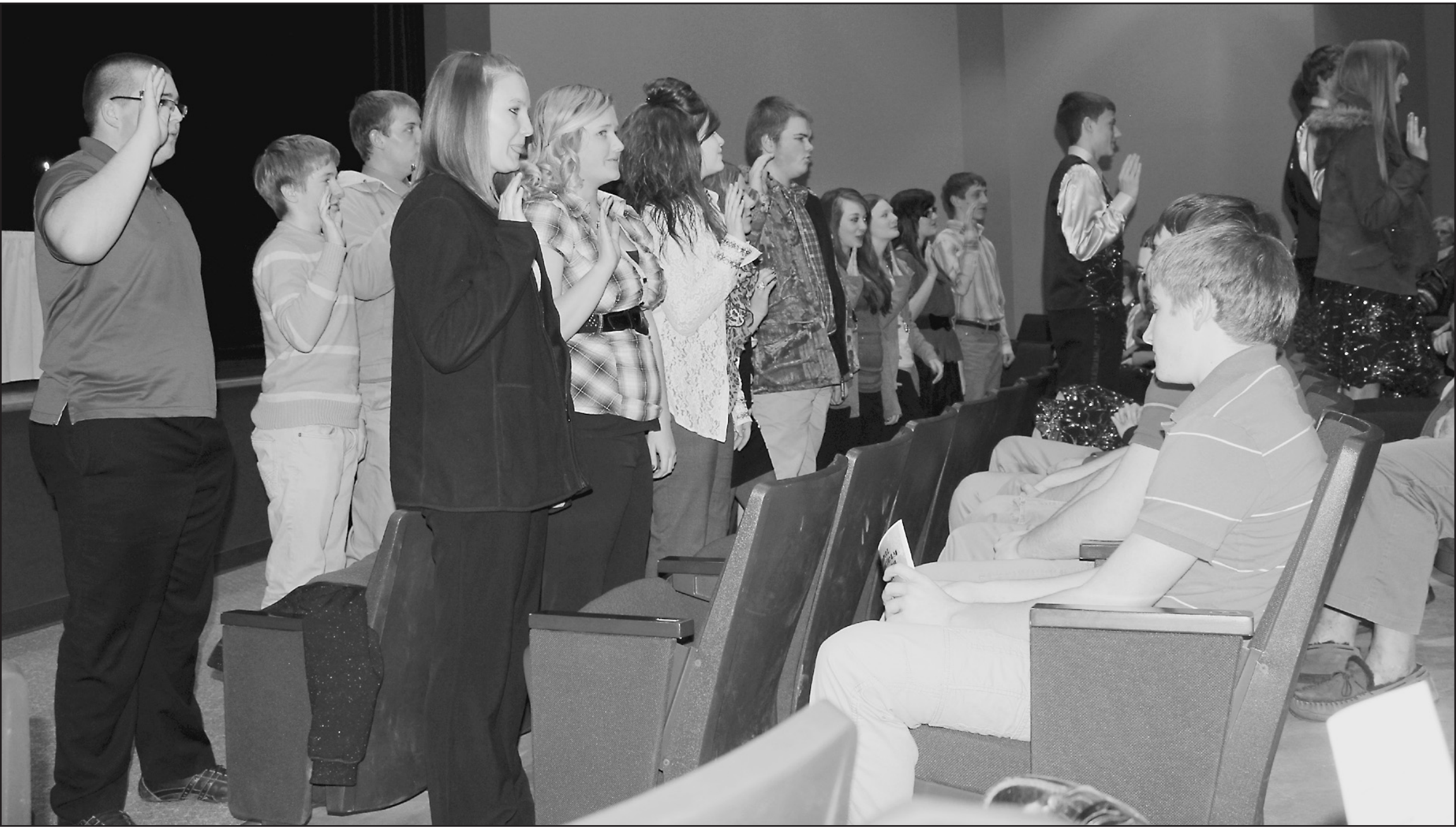
INDUCTEES TAKE THE OATH to become members of the Decatur Community High School National Honor Society.