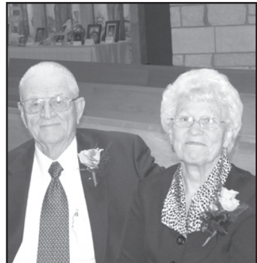
The Moores in 2012