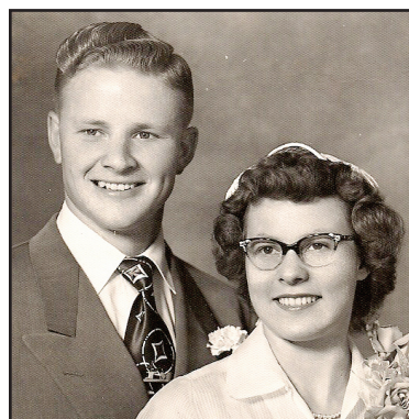
The Moores in 1952