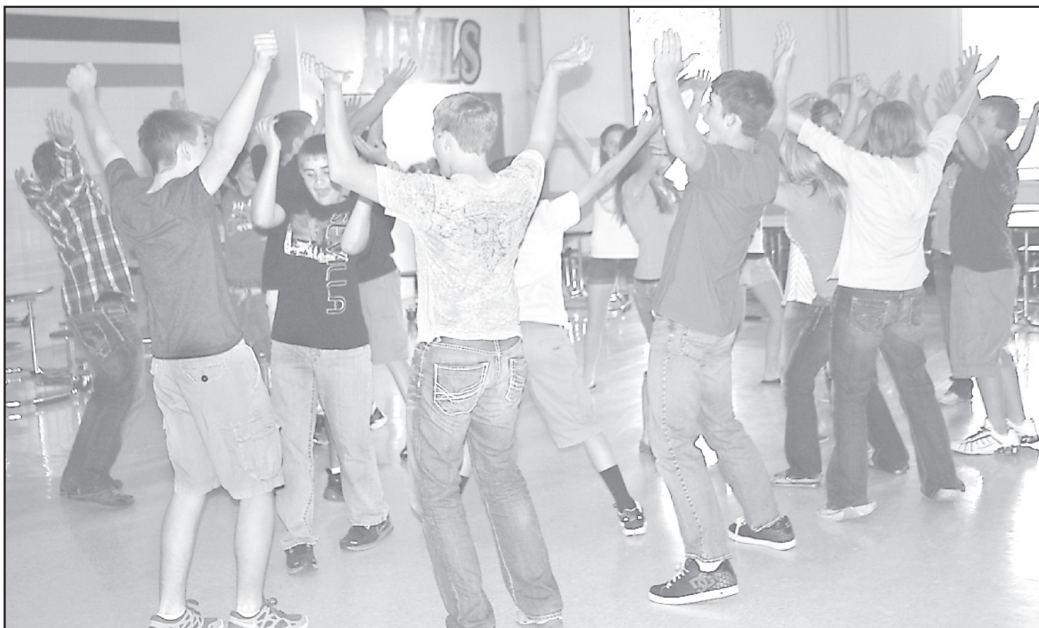
THE DECATUR COMMUNITY JUNIOR HIGH the school cafeteria on Saturday, April 28. students had a good time at the Student Council dance in