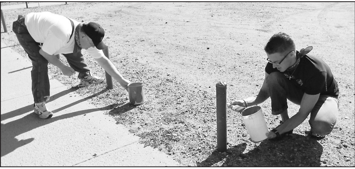
MEN FROM the Celebration Community churches of Hays and Colby helped paint barriers at the school in Rexford over the weekend.