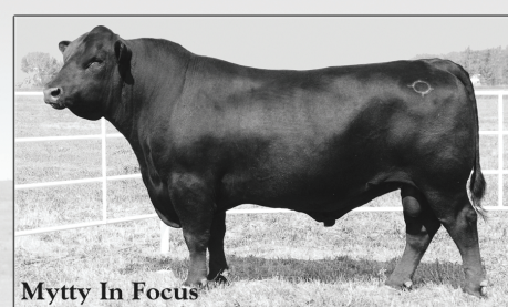
An outstanding set of black bulls featuring sons of DX Thunder, Olie, In Focus and Net Worth.