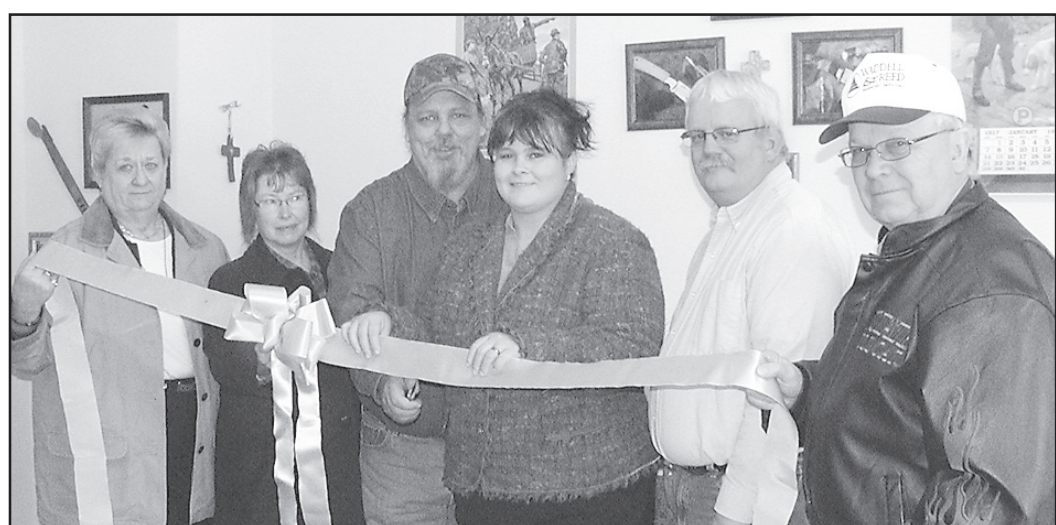
The Oberlin Herald and Chamber of Commerce welcome