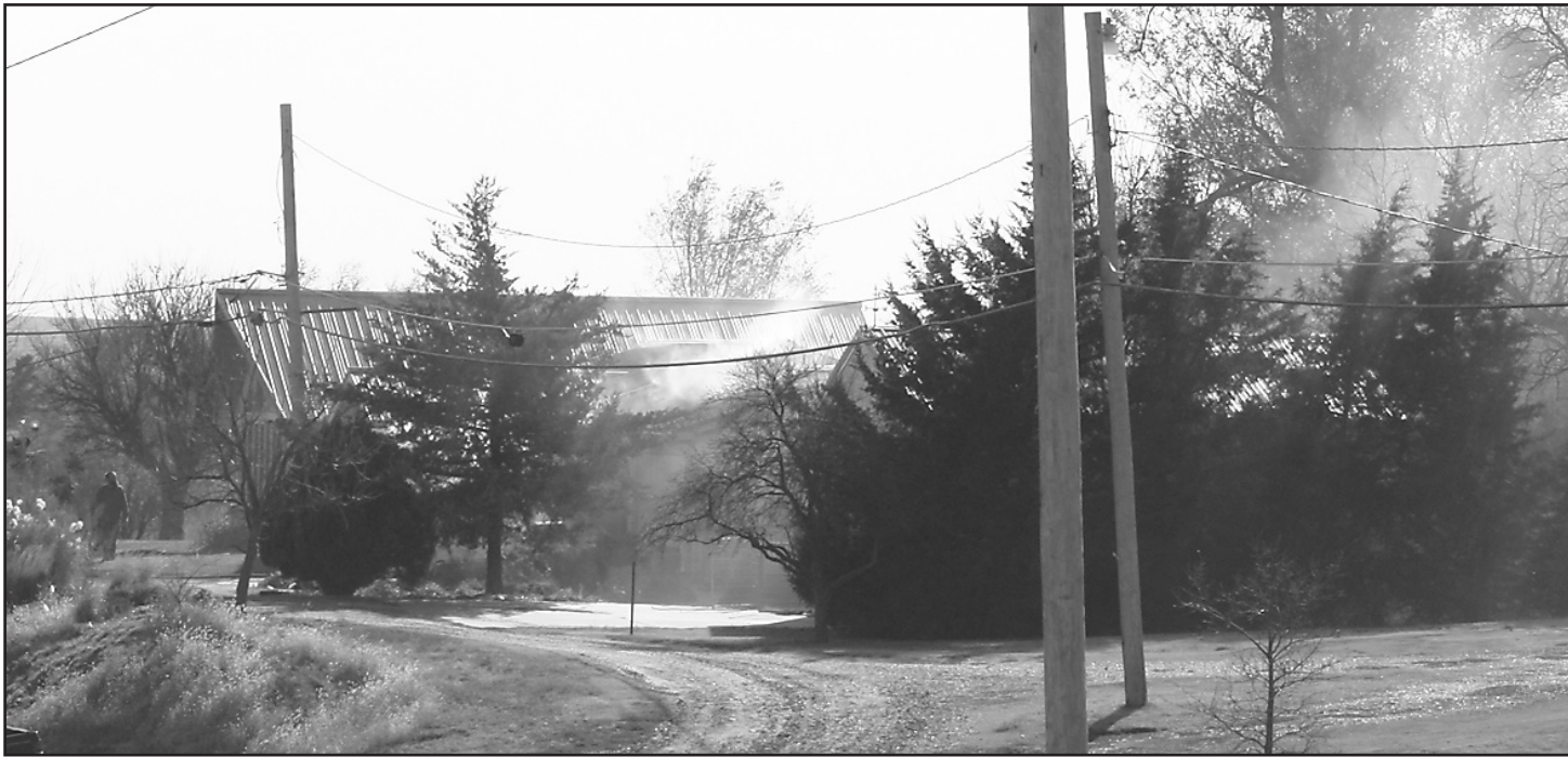
SMOKE POURED out of the Shirley house on Antelope Avenue on Saturday afternoon (above) after an electrical fire spread quickly to the garage. Volunteer firemen (top)

on the south side of the house started to wrap up the hose back on the truck after the fire was almost out.