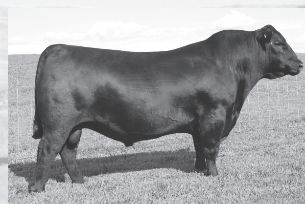
SAV Bismarck 5682

13th Annual Prime Cut on the Hoof Sale Performance-Tested Registered Angus Bulls Thursday, March 31, 2011 Imperial Auction Market • Imperial, NE • 12:30 MDT