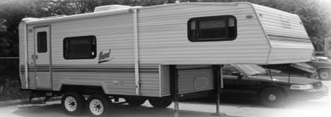
'94 Nomad 21' fifth wheel travel trailer