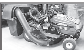
Lawn General, 17 H.P., 42" riding mower w/grass catcher, like new