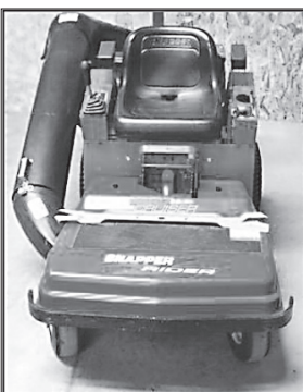
Snapper Hi vac, yard cruiser riding mower w/grass catcher