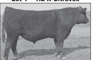
Lot 1 • 112 X Ultravox

B W Y M Marb RE SB 3.1 58 100 24 .60 .11 55.58