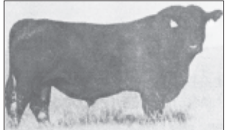
SAV 004 HOLD'EM 4452

(130) 18 MO. OLD REGISTERED ANGUS BULLS FOR SALE ON FARM