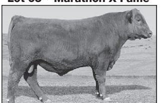
Lot 63 • Marathon X Fame