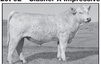
Lot 92 • Slasher X Impressive

B W Y M Marb RE SB 3.0 59 101 24 .60 .15 58.39