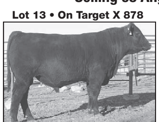
Lot 13 • On Target X 878

Selling 98 Angus & Charolais Bulls • 12-2yr. olds • 50 Coming 2's • 36 Yearlings