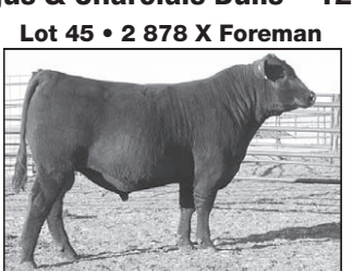
Lot 45 • 2 878 X Foreman

B W Y M Marb RE SB .8 52 92 24 .18 .30 40.21