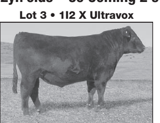
Lot 3 • 112 X Ultravox

B W Y M Marb RE SB .8 52 92 24 .18 .30 40.21