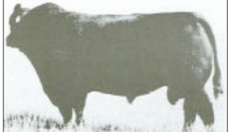
WAR FORE FRONT

Bulls are in the top 2% of the breed for both weining & yearling EPD's.