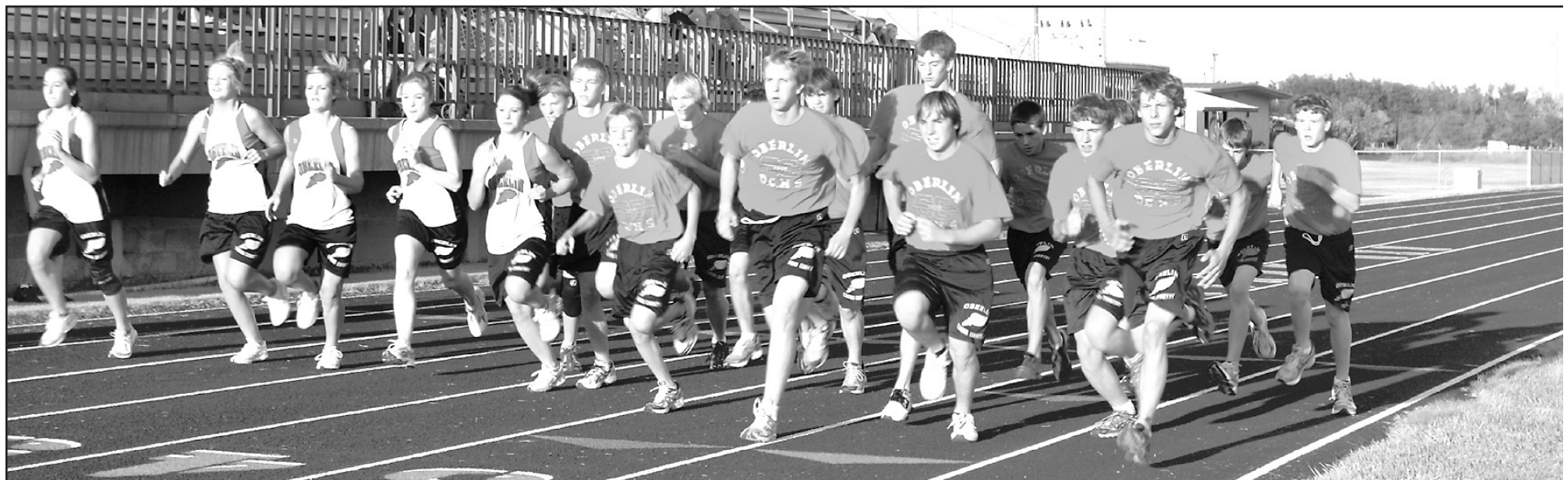
THE OBERLIN CROSS COUNTRY TEAM was off and running during the annual Soap Scrimmage and Run on Thursday. After circling the track, the team headed into town, then returned to the field for another lap.

The Oberlin cross country team will be in Norton on Thursday for the first race of the year. The Norton Invitational will start at 4:30 p.m. at the Prairie Dog Golf Course south of town. Teams from Stockton, Hill City, Hoxie, Northern Valley, Phillipsburg, WaKeeney and Wheatland, as well as the home team and Oberlin, will be running. The junior varsity race will start at 4:30 p.m., the girls varsity at 5 p.m. and the boys varsity race at 5:30 p.m. The boys will run 3.1 miles and the girls, 2.5 miles.