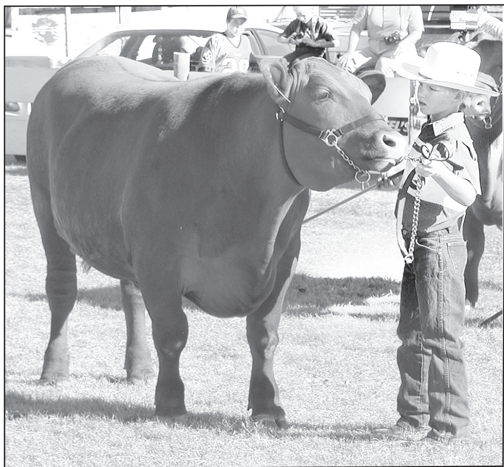
A young cowboy showed off his animal during the beef show at the county fair. The livestock auction during the fair helps many young 4-Hers earn money for college.

Jennings, south of U.S. 36 on K-383, is a Czech immigrant community. Each year the city holds the annual Fireman's Fun Day, with a parade, games, food and entrance to the Czech Museum.