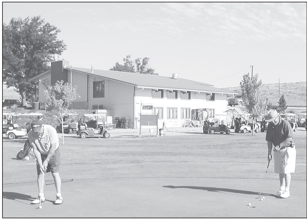
Riverside Recreation, 2 miles west of St. Francis on U.S. 36, offers a 18 hole golf course along the scenic, cool river bottom. The club house opens at 5 p.m. on weekdays and open on weekends.

The Stearman Fly-In features the World War II vintage open cockpit and fabric-covered biplanes powered by radial engines. Last year, there were 14 Stearman as well as around 110 other aircraft. Early Saturday and Sunday morning, hot-air balloons fire up for a different view of the Cheyenne County countryside. Throughout the two days, there are tandem jumps where a novice passenger rides with an expert skydiver, both sharing a single canopy.