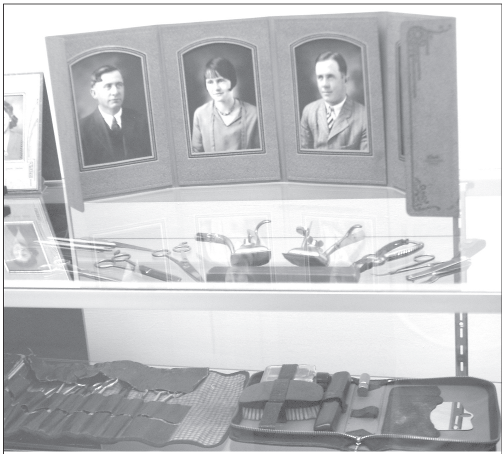
Artifacts from the early days of Smith County are displayed at the Kanza House Genealogy History and Resource Library in the former Lebanon High School.

Smith County is rich in history and overflowing with amazing people, she said.