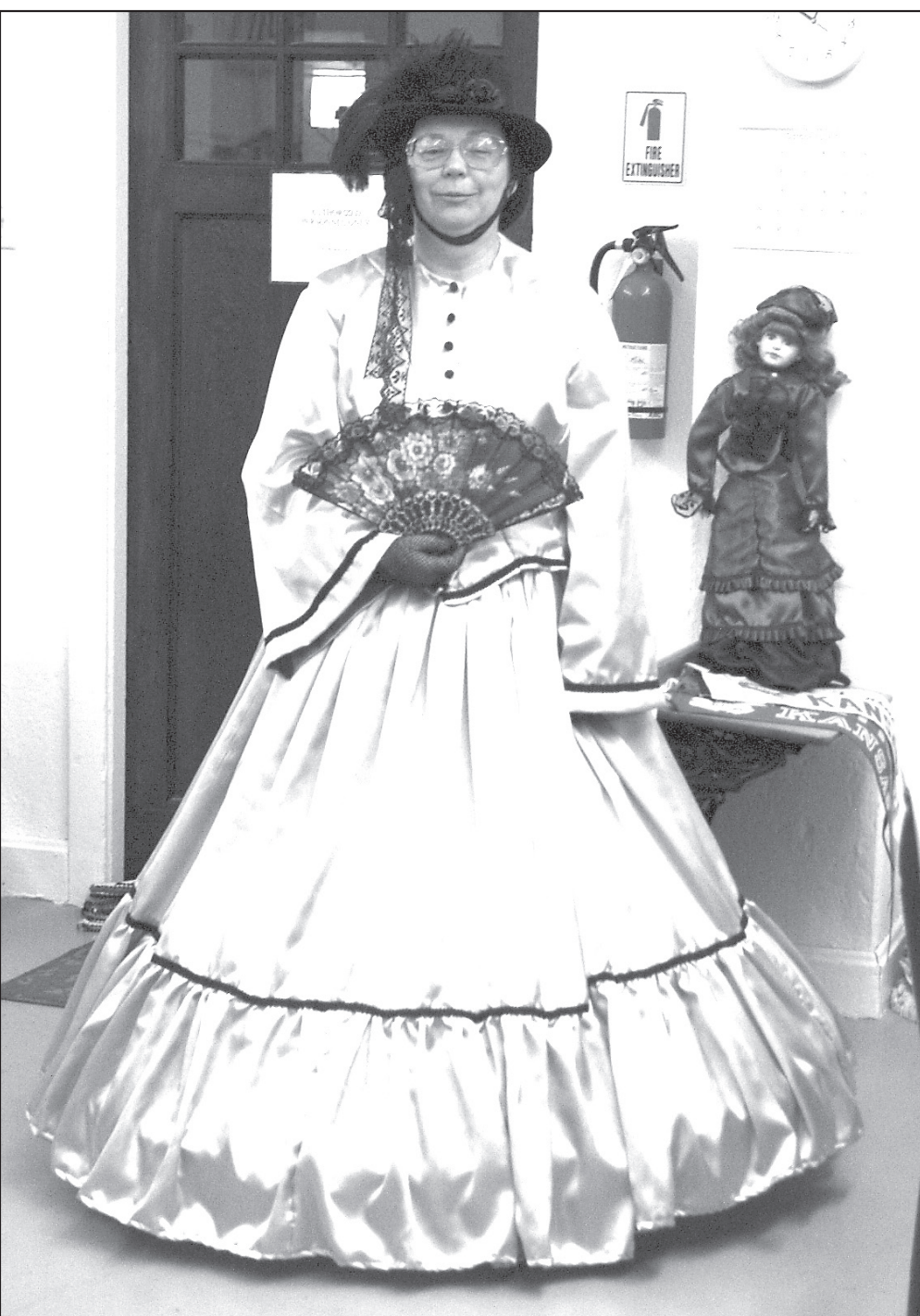
Costumes of yesteryear show how our ancestors dressed.