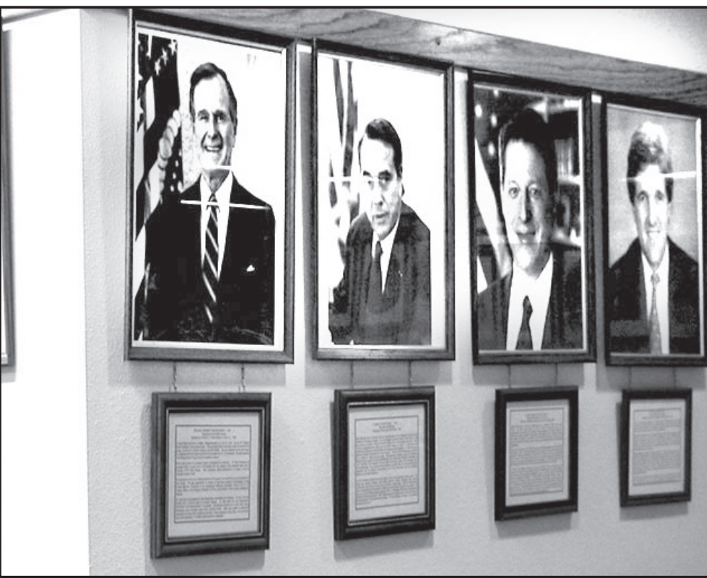
From Thomas Jefferson to John Kerry, the Also-Ran Gallery offers a glimpse of those who weren't elected president when they ran.