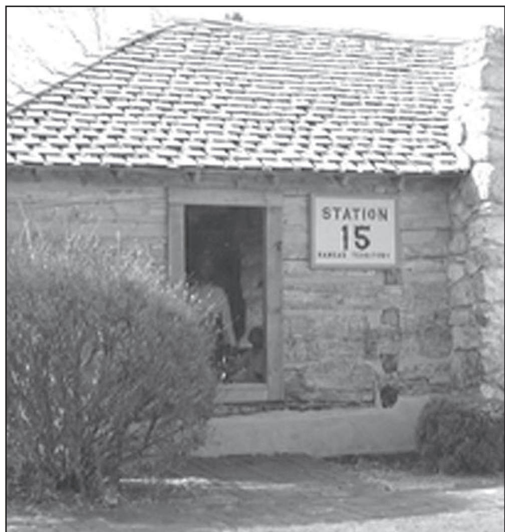
Station 15 stands in a roadside park along U.S. 36. Many notable figures passed through Norton on the stage in the early days of the settlement.