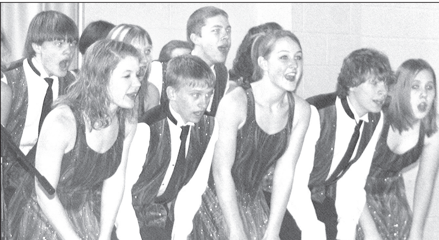
THE DCHS SINGERS performed earlier this month. The group will be giving two shows during the State Wrestling