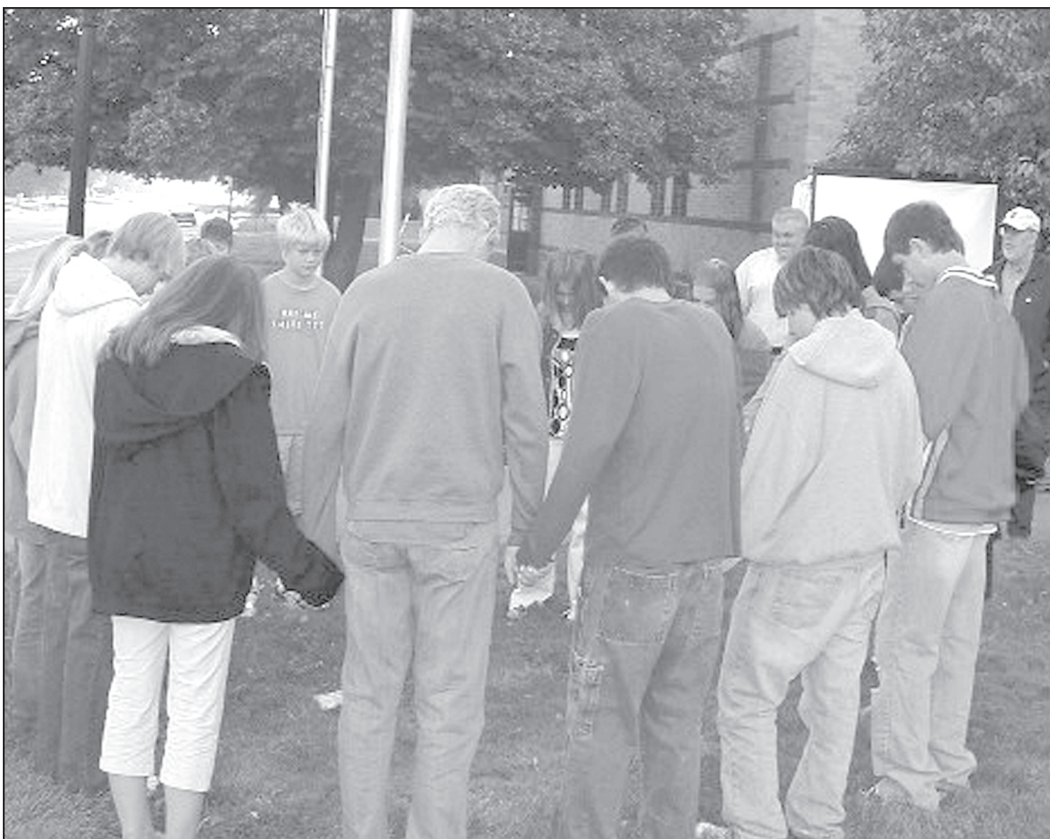
AROUND THE FLAG POLE out front, students from Decatur Community High School met to pray last Wednesday before school as part of the annual See You at the Pole event.