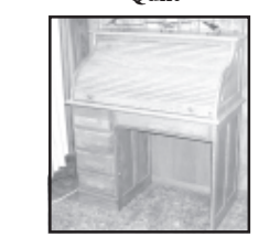
Solid oak roll-top desk w/chair

Lots of Miscellaneous too numerous to mention! Lunch will be served.