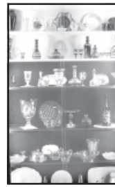
Lg. showcase cabinet w/light

Sofa, like new * Wood dinette table w/ 4 upholstered chairs * (2) matching recliners * Rocker * RCA 27" color television * Several table lamps * (2) Wood end tables * 4-Drawer chest * Cedar chest * Double bed w/mattress, box springs * Complete Queen bedroom set inc. bookcase bed, mattress, box spring, dressers, chest, very nice * Telephone stands * (2) Matching upholstered rockers * Desk w/chair * (2) Twin beds w/ mattress, box springs (2) Twin mattresses * Desk