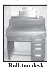
Roll-top desk (2) Book cases * Sm. chest-of-drawers * (4) Cedar chests (all sizes) * Dressing machine & table * gun cabinet

Holmes & Edwards Inlaid Silverplate silverware (12 piece set) w/chest, very nice Old mirror from dresser * Old jewelry including pins, rings K-State year books 1939-1945, 1947, 1949, 1950 Old pocket & wrist watches Lg. assortment marbles including several lg swirl Tin sign "Nebraska Farmer Protective Service" Lg. "Mobil" oil can * (3) Kerosene lamps