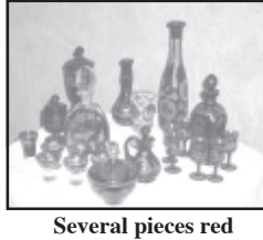
Several pieces red Bohemian glass Bohemian glass cake plate w/silver plated pedestal Bohemian candy dish

Homer Laughlin covered vegetable dish and platter * Brilliant cut crystal low bowl * Pink Depression, several pieces * Bohemian barber bottle * Carnival glass * several pieces red Bohemian glass * Greek Key creamer, sugar, covered butter dish * Lots of cut glass * Liquor decanter w/glasses * tea leaf iron stone pitcher & platter * Germany creamer & sugar * (2) Germany flowered bowls * Japan salt and pepper sets * (12) Crystal plates * Crystal goblets & glasses * Crystal pitcher * Glass Bowls