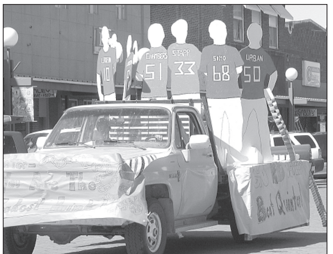
ONE OF THE FLOATS had large cutouts of several of the football players on it.