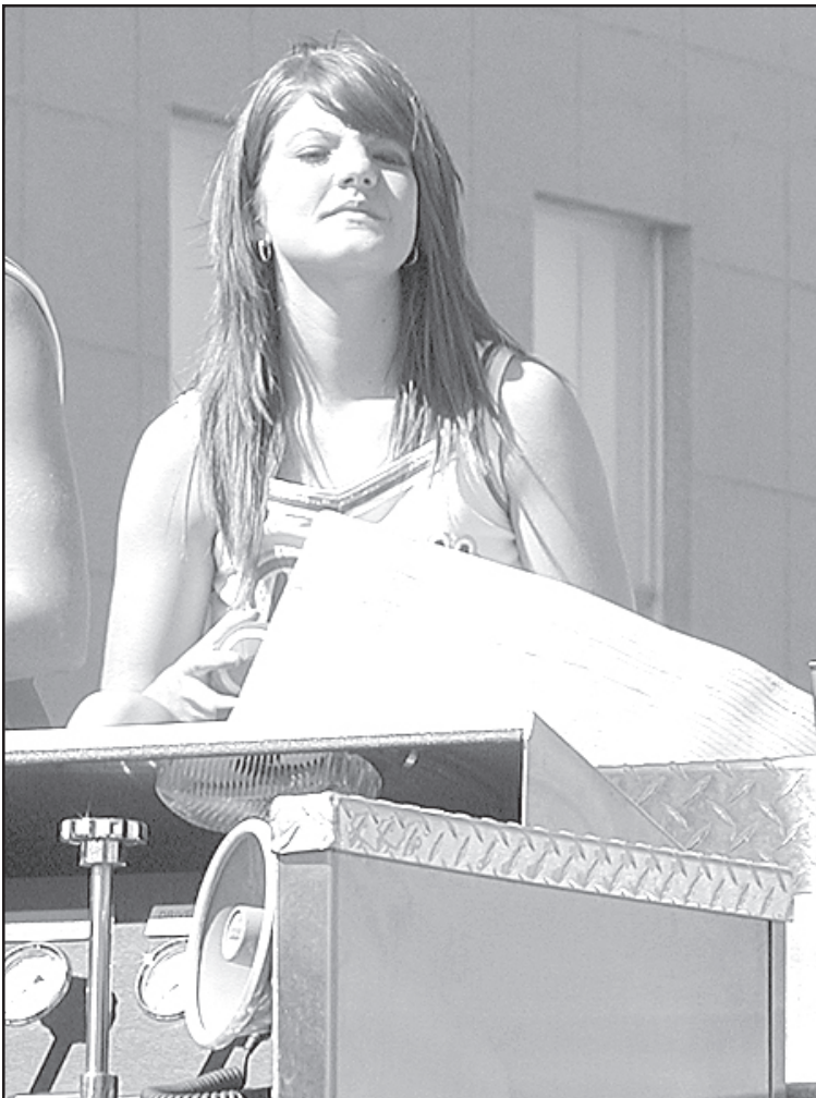
KIRAMEITL (above) rode on top of the fire truck as she threw out red footballs to the crowd on the street. The Class of 2008 (below) decorated the front of the truck with its float with a snappy phrase.

They weren't the only winners of the evening as the seniors took first in the float competition, juniors second, freshman third and sophomores fourth.