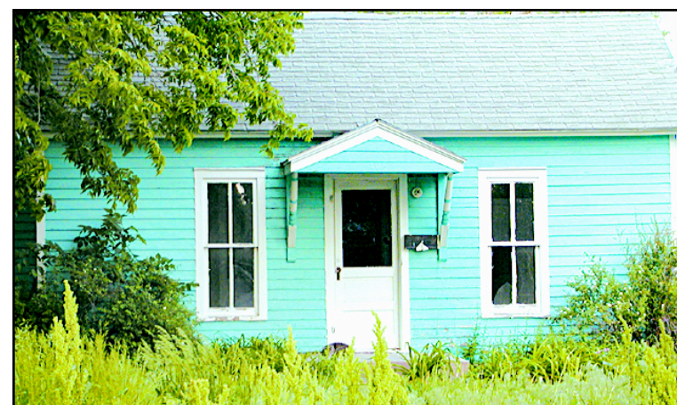
THE CITY received a petition about this house at 107 N. East Avenue to declare it abandoned.