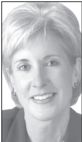
Kathleen Sebelius for Governor