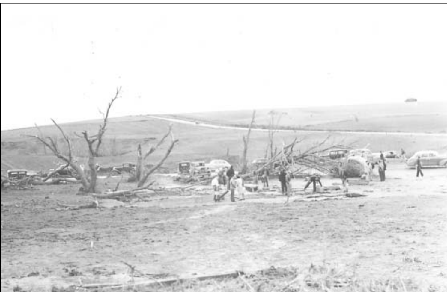
THE TORNADO , which cut a devastating path east of Oberlin on April 30, 1942, left 14 dead, stripped and uprooted trees and caused thousands of dollars in damages to farmsteads.