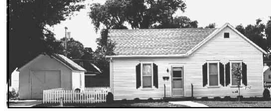
113 S. Cass. Two bedrooms, 1,080 sq. ft., totally restored w/hardwood floors and new wiring, plumbing, central air/heat, roof, ceiling fans, siding, underground sprinkler system, driveway & patio. Charming kitchen features new cabinets, stove and flooring. Main floor laundry plus small basement room.