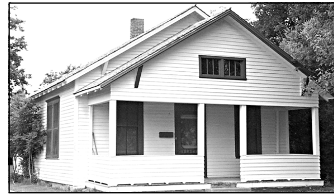
209 S. Cass. Newly painted, 2 bedrooms, stove, refrigerator, washer, dryer, claw-foot bathtub.

Call us today for a complete list of all the properties listed. Office — 785-475-2785