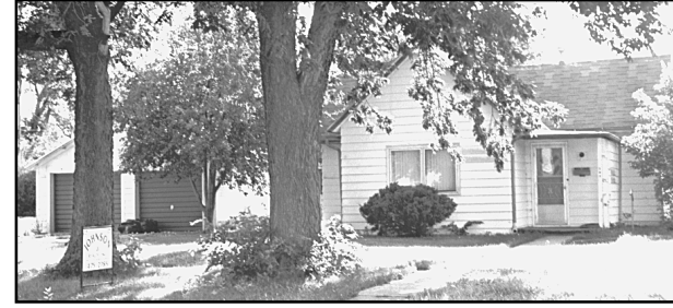
209 S. Beaver. Mature shade trees, 1,120 sq. ft., 2 bedrooms, parlor/dining room, kitchen, main level laundry, partial basement, fenced backward, nice double, detached garage.