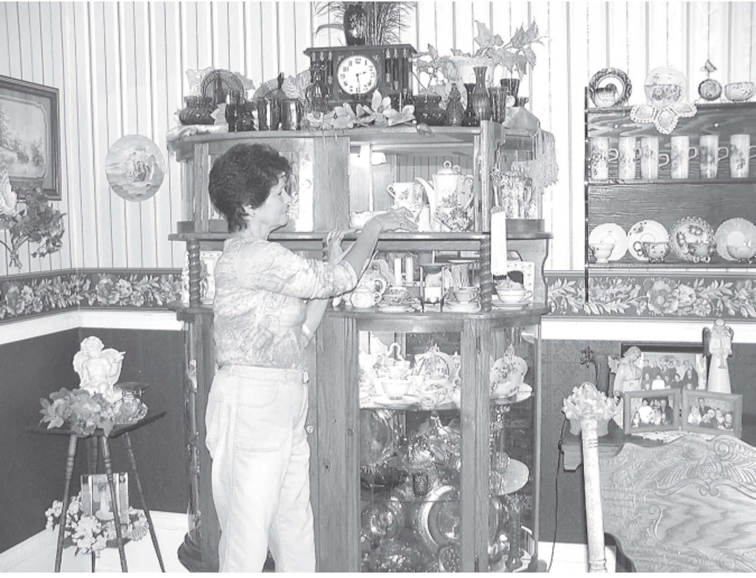
Dozens of tea cups, glass pieces and knick knacks of all kinds fill a glass-fronted hutch in the Rose of Sharon Bed and Bath.