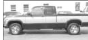
1996 DODGE DAKOTA — 4X4, X-cab, SLT, V-8, automatic, cold air, PW/PL, CD player WAS $4,695 ..... SALE $3,995