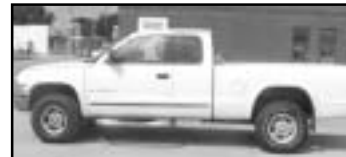
1998 DODGE DAKOTA 4X4 — X-cab, SLS, V-6, auto., all power, alloy wheels, chrome nerf bars, mid miles, sharp truck SALE ..... $10,995.00