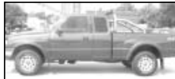
1998 MAZDA B3000 4X4 X-CAB — Red/gray cloth, roll bar, bedliner, rear sliding window, only 53,000 miles. WAS $10,995 ..... SALE $9,850