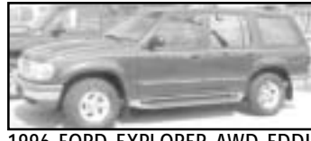
1996 FORD EXPLORER AWD EDDIE BAUER — V-8, auto., leather, power sunroof, 6 disc CD, dual power seats, new tires, cherry color, boards WAS $8,995 ..... SALE $7,950