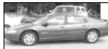
2000 DODGE INTREPID-SE — 4 door, loaded, cloth interior, buckets, rear spoiler, only 48K miles, nice car! SALE ..... $8,950