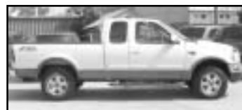
2002 FORD 1/2T 4X4 X-CAB — FX4 offroad, 5.4L, auto., all power, boards, bed liner, new tires, 35,000 miles WAS $22,695 ..... SALE $21,950