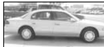
1996 LINCOLN CONTINENTAL — LS 4 dr., silver with silver leather, loaded, dual power seats, local trade-in, only 67K. WAS $7,895 ..... SALE $6,995