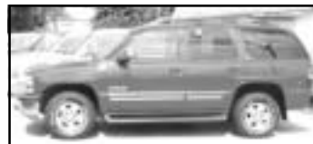
2002 CHEV. TAHOE 4X4 — 4 dr., LT, loaded, bright red, leather, CD/cassette, 3rd seat, rear heat/air, 41K, 1 owner WAS $27,695 ..... SALE $26,900