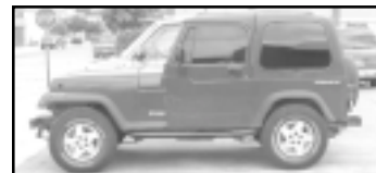
1995 JEEP WRANGLER 4X4 HARD TOP — Bright red, running boards, fancy tires and wheels, 96,000 miles. WAS $7,995 ..... SALE $6,950