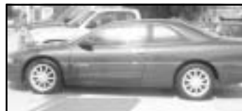
1997 CHRYSLER SEBRING LXI — 2 door, V-6, auto., leather, CD/cassette, power sunroof, all power, power seat, rear spoiler, alloy wheels SALE $6,995