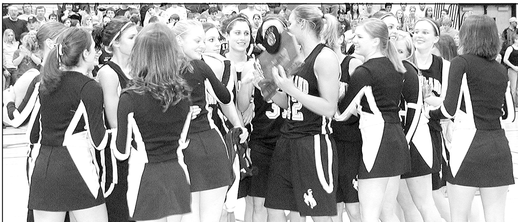
Goodland Cheerleaders and Cowgirls celebrate the winning of Substate at Scott City Saturday.