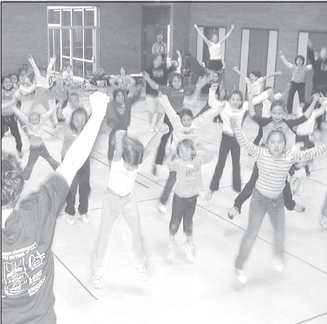
The Goodland Cheerleaders 'Little cheerleader' clinic was this week, and those who participated will perform tonight at the halftime of the Cowboys basketball game at Max Jones Fieldhouse.