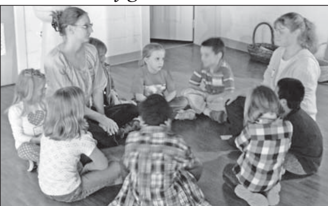
Kids and volunteers participated in games and arts and crafts activities at the High Plains Museum's Valentine's Day event. Later in the evening, adults were invited for a "walk under the stars" and a view of the museum's new satellite photo exhibit.