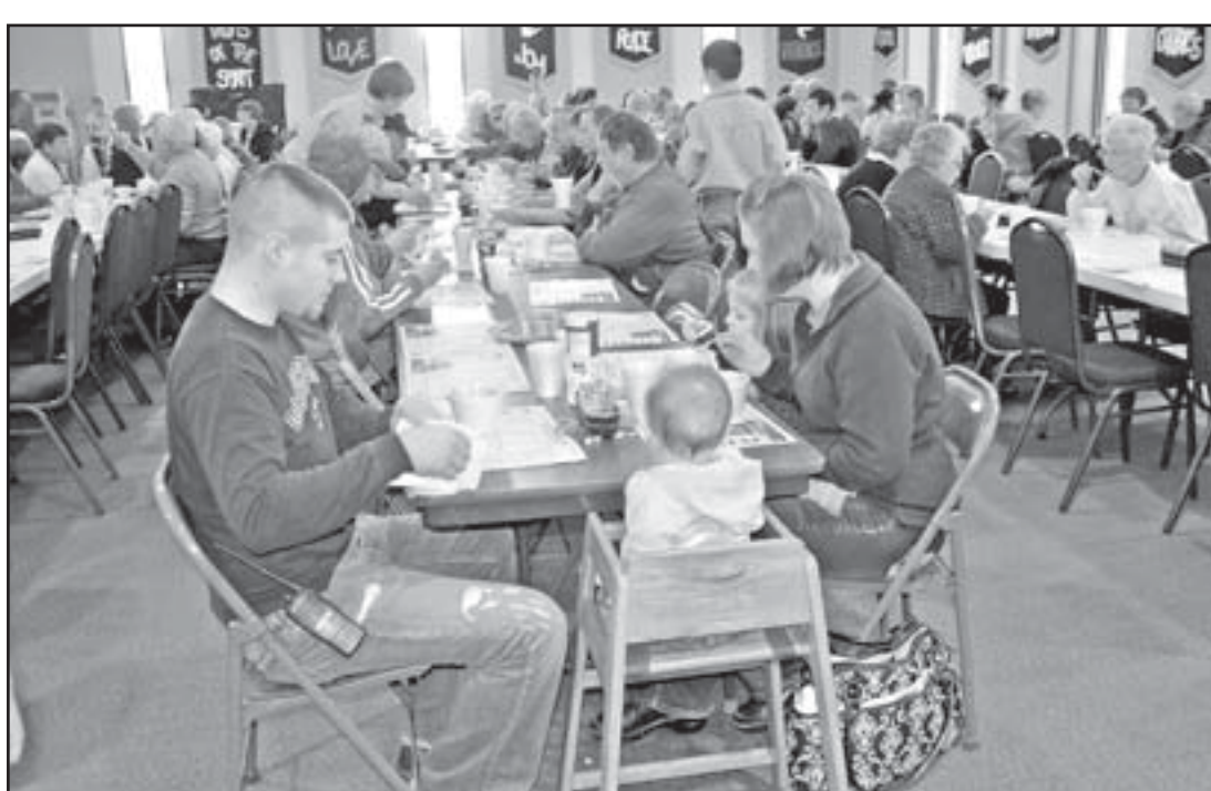
This young family and many others were at the Boy Scout Chili Feed on Saturday at the Goodland United Methodist Church Fellowship Hall. They served chili, vegetable soup, cobbler, cake and drinks. The yearly event serves as a fund raiser.