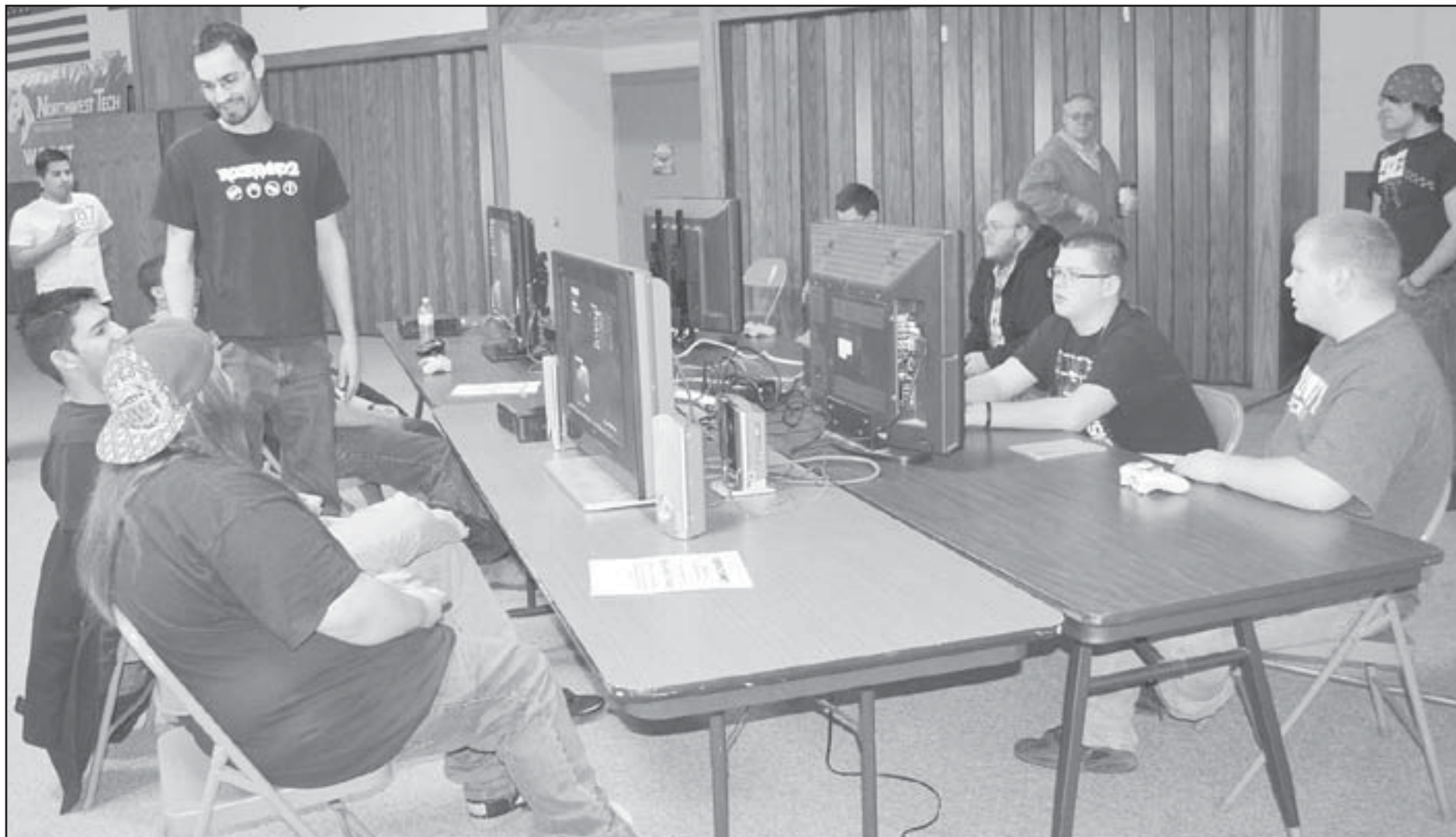
Gamers gathered Saturday morning at the Northwest Technical College Student event was held by the Kansas National Guard. Gamers to compete in teams against each other in a video game tournament.