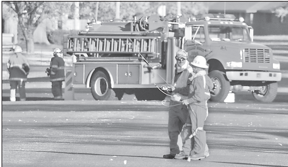
City workers, firefighters, law enforcement and crews from Black Hills Energy worked late into the night on the gas leak in October. The leak forced the evacuation of about six blocks.

In early January, the Sherman Rural Fire District 1 board brought a resolution for consolidation to