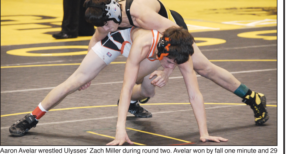
seconds into the first period.