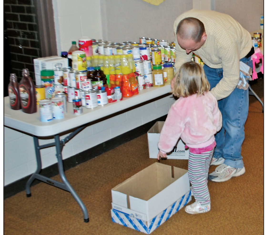
Volunteers helped put together boxes of food for the Genesis food bank on Thursday. This year, Genesis took in enough food for 150 baskets, which will feed about 400 people, and enough toys for 150 children.

City residents will be able to get a free license for their animal. They must provide written proof City ordinances require all dogs that the animal has current rabies vaccination.