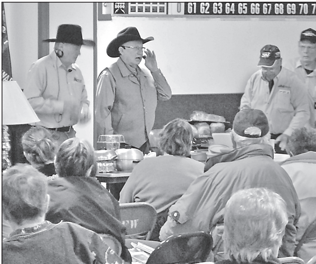
The Goodland Veterans of Foreign Wars post held its White Elephant Sale on Saturday. The event raises money for candy, which will be given to kids when Santa visits the post at 10 a.m. this Saturday.