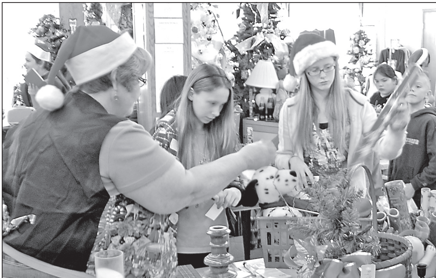
The Goodland Churches Thrift Store held its annual Kids Christmas Shoppe on Saturday. The popular event allows kids to come in and shop for presents to give out, while parents get to wait outside.