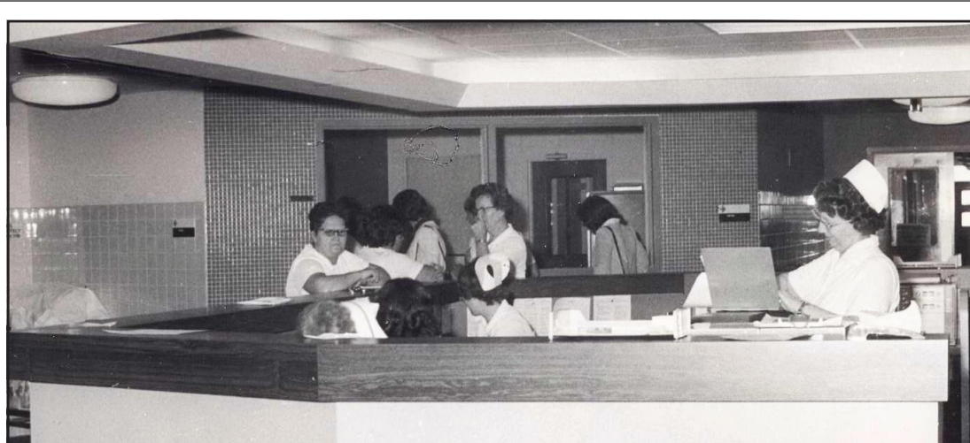
The Goodland Regional Medical Center nurses' station in 1975.

Where public information is accessible to the public.