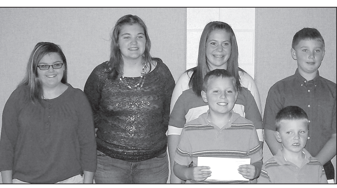
Some of the Sunflower 4-H Club who received awards.