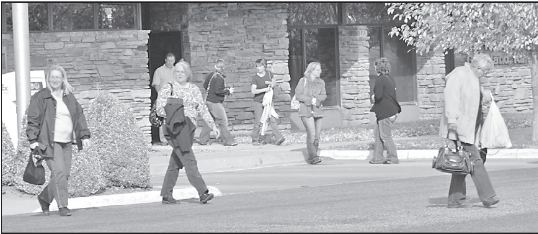
Employees from First National Bank were among the first to be evacuated Wednesday due to the leaking gas pipe in the alley next to the building. Several surrounding blocks were evacuated, including at least three residential blocks. The all clear was given at 7:45 that night.