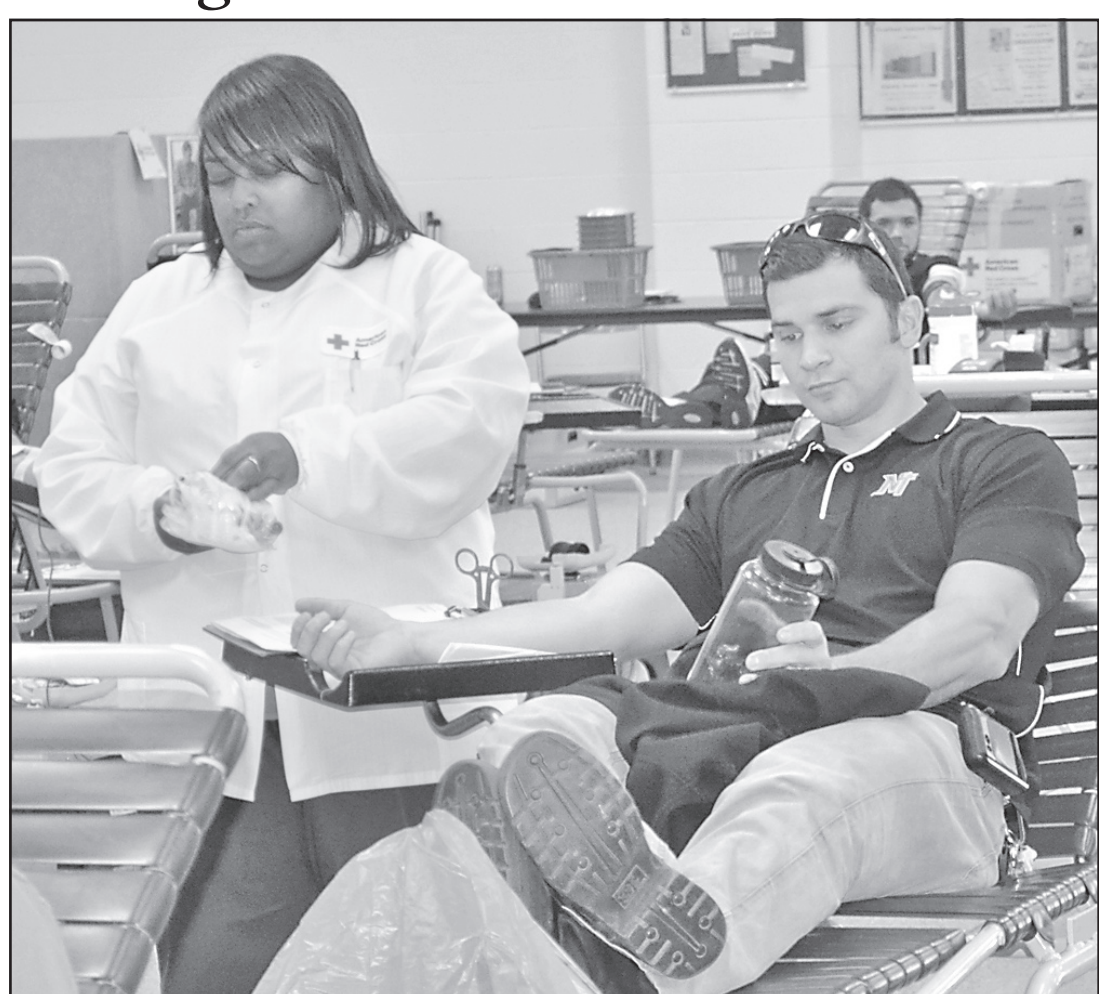
The Red Cross was at the Northwest Kansas Technical College Student Union on Wednesday collecting blood. Students and instructors waited their turn. The blood may be used by people who are having surgery or have been in accidents.