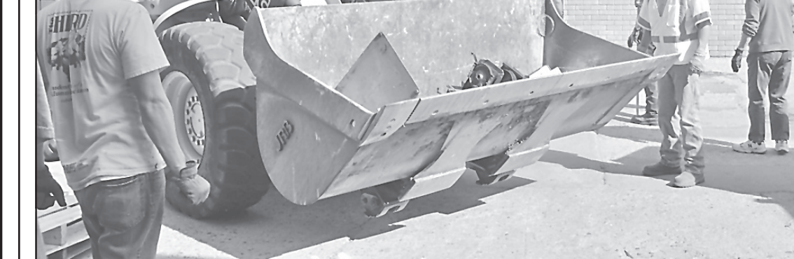
This week was city clean-up week. Crews hauled away junk free of charge. Sherman County has also declared a clean-up week extending to next Friday. Fees will be waved at the landfill for any county residents with county tags on their vehicle.