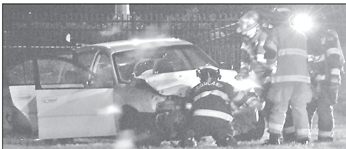
Goodland firefighters examine a car that wrecked near the Giant Van Gogh after a short chase Sunday night.

Three children were taken to the hospital Sunday night after a woman fled from police and crashed her car into a fence at U.S. 24 and Cherry Avenue.