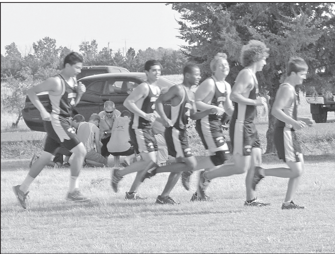
The Goodland High School boys cross country team warmed up for their race at the Goodland Invitational on Thursday at Sugar Hills Golf Course. The team took fourth place overall.