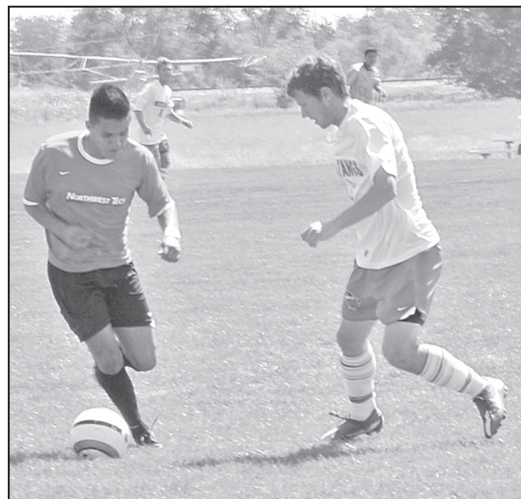
The Northwest Kansas Technical College mens and womens soccer teams played their first home games ever on Friday and Saturday at the college soccer fields. The Lady Mavericks won both games against Western Wyoming Community College from Rock Springs, Wyo, 2-1 and 3-2. The boys lost on Saturday 2-4. The teams played against Neosho County College on Monday. The women tied 0-0 and the men lost 1-0. The next home games are Saturday, Sept. 22, against Lamar.