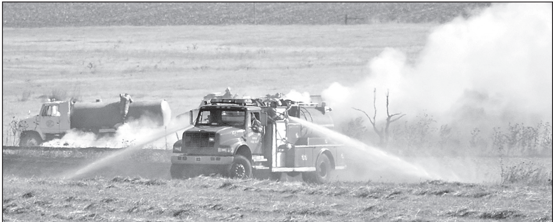
Sherman County firefighters wet down the burn area south of town on Friday. The department had the fire out within an hour of the emergency call, and then were dispatched to a car wreck on K-27 about five miles south of Goodland.