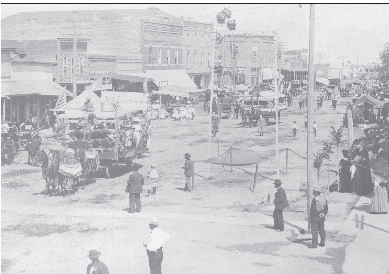
An early photo of Goodland's Main Street (above) shows the brick buildings put up after the many fires of the early 1900s, but predates the 1921 installation of the brick streets. The Short Order House (left) was one of the earliest buildings in town.

When the election results came back, Goodland was the winner with 872 of 1495 votes. Eustis received 611.