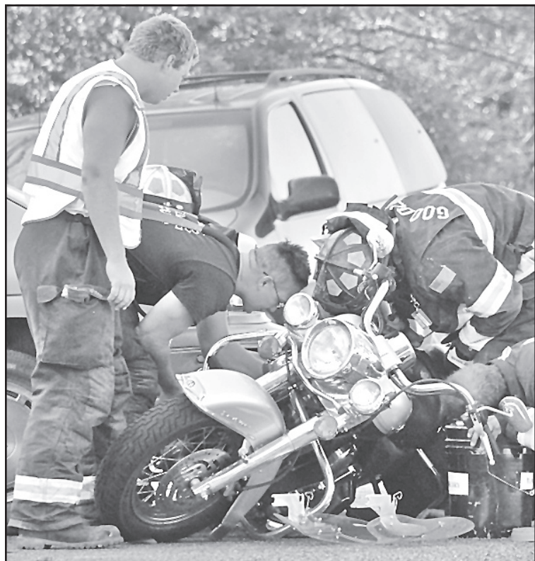
Emergency responders examined a motorcycle that had been struck by a car on Monday afternoon. The driver received only minor injuries.

Intervention Team. If a firefighter were to go down inside a structure, the team is on standby to go in and rescue them.