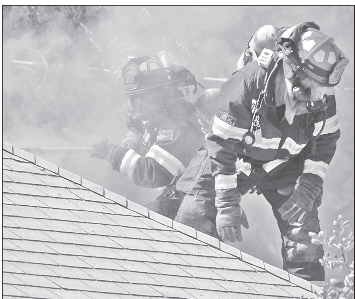
Goodland firefighters used a saw and other tools to cut a hole in the roof of this house at 320 W. 11th Street in order to ventilate smoke from a fire inside.