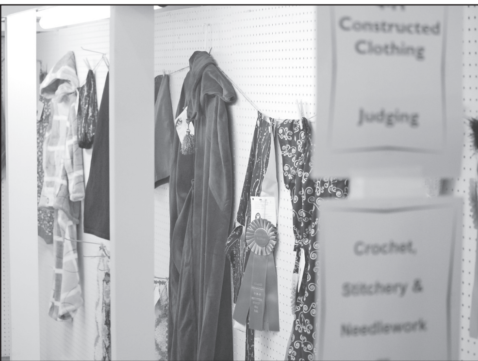
The fair isn't just about livestock. Other judging competitions included clothing construction, various types of sewing, cooking, crops, presentations, fashion and more.