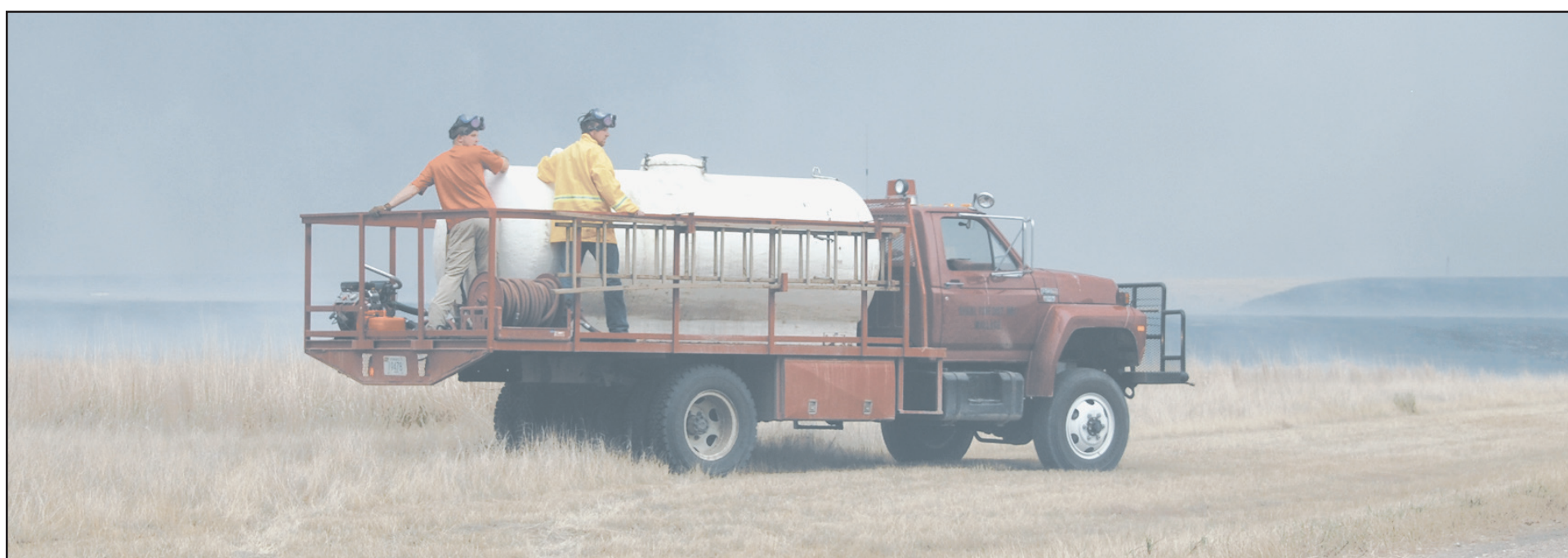
A fireman hopped on board this tanker to help fill up other trucks with water at the T-Bar Ranch fire Wednesday night. Firefighters from Goodland, Sherman County Rural and several other area departments fought the fire through the night and had it out Thursday morning.