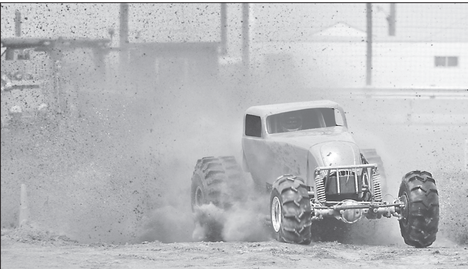
The Kiwanis mud bog races were held Saturday afternoon at the Sherman County Fairgrounds. Contestants in several vehicle classes had to see how well they could drive across a mud patch.