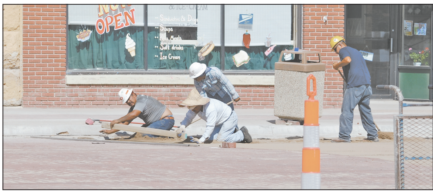
Workers began this week on laying the brick on Main Avenue between 12th and 13th Streets, signaling that the project is nearing completion and the street will soon be open. On Thursday, this crew was laying down the sand base.