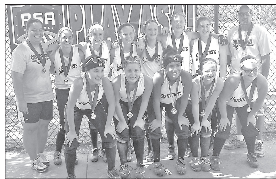
The Goodland Slammers softball team posed with their medals from the state tournament on July 13 to 15 in Topeka.

What an amazing season, and what a great way for it to end! We would like to thank all of the Goodland Softball Club booster club sponsors. Without you, these They were scheduled to play in tournaments wouldn't be possible.