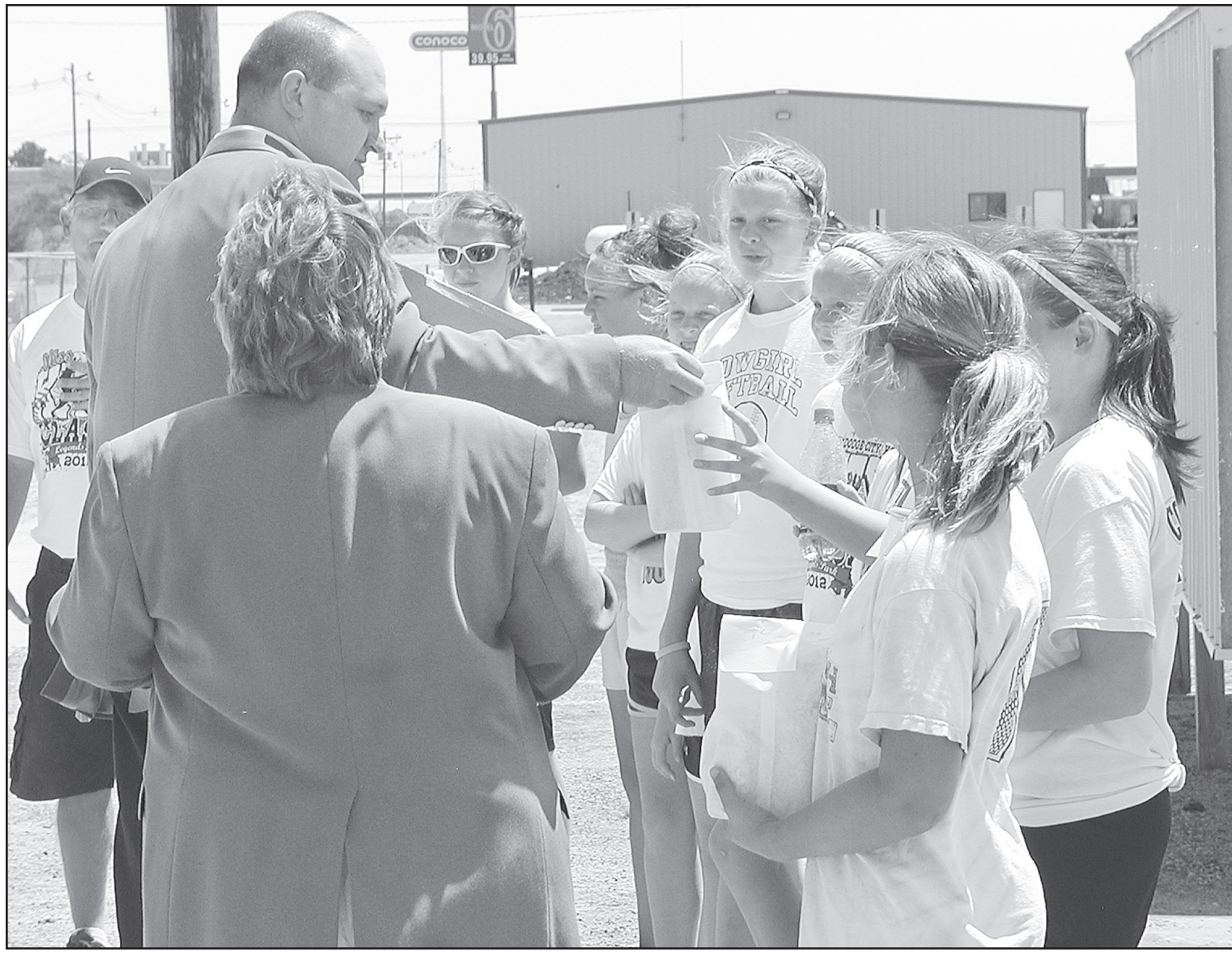
Members of the Goodland Ambassadors handed out treat bags to the Goodland Slammers 12 and Under softball team at a sendoff ceremony last week at the softball fields.