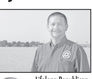
Lifelong Republican Primary Election August 7, 2012